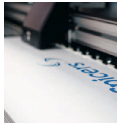
Sign & Display – Hardware