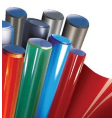
Sign & Display – Consumables