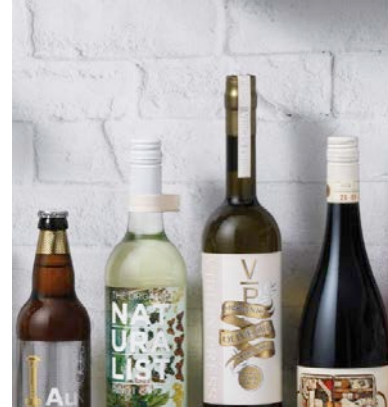
Label & Packaging